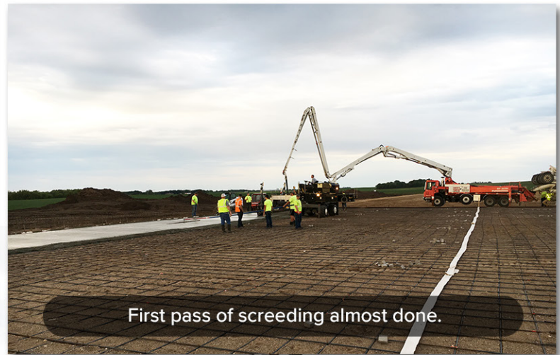
First pass of screeding almost done.