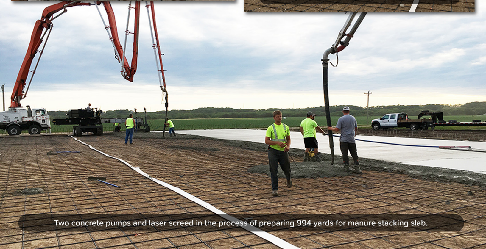
Two concrete pumps and laser screed in the process of preparing 994 yards for manure stacking slab.