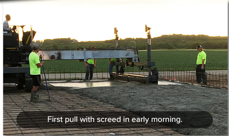
First pull with screed in early morning.